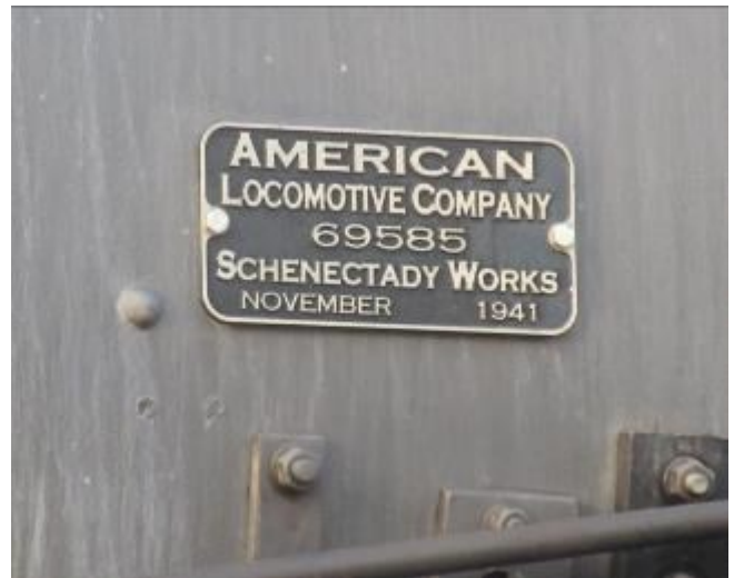
The Great Race Across the Midwest Union Pacific's No. 4014